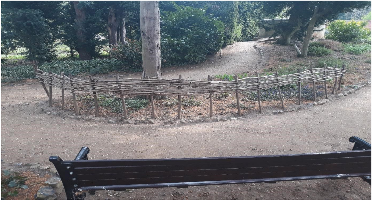
Willow fence being built by Town Council staff using branches from Town Council willow trees which had required pruning or cutting back