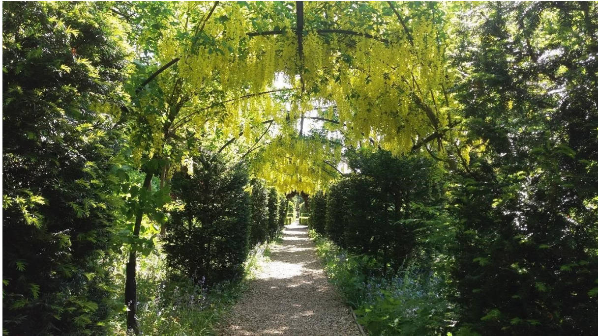
Canopy of trees at Bridge End Gardens, providing a beautiful natural environment.

At its Full Council meeting on 8 th April 2019, Saffron Walden Town Council (SWTC) resolved to declare a climate emergency and committed to the following: