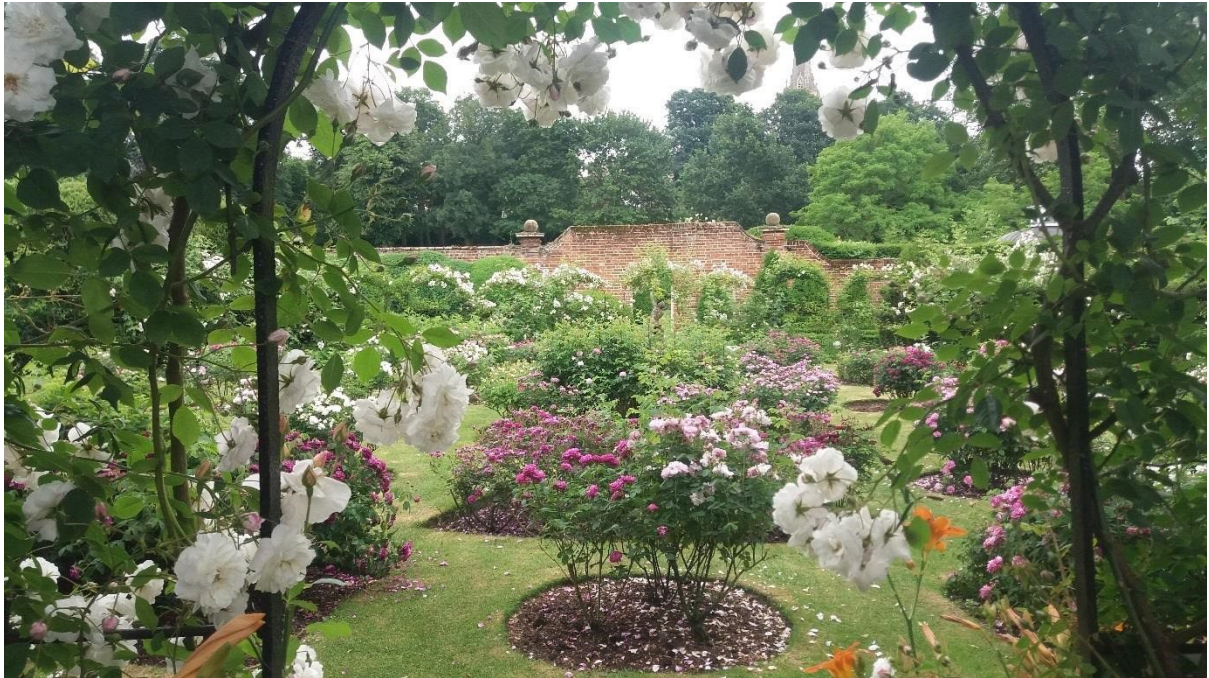
The stunning rose gardens, a haven for bees, bugs and wildlife