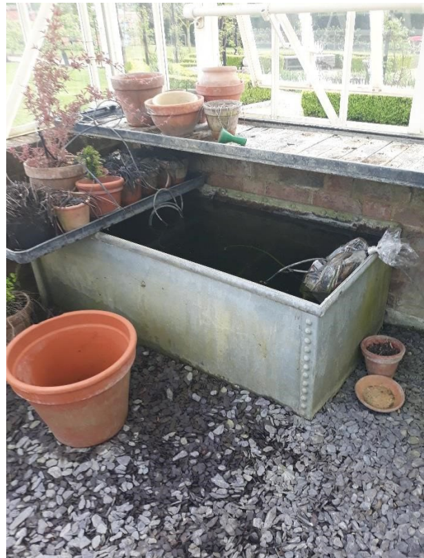
Water troughs to collect rain water. These are placed throughout the Town Council gardens and public open spaces (always in a safe and secure area) and used for watering plants