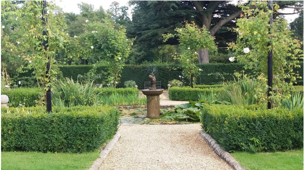
Ponds at Bridge End Gardens – a haven for wildlife