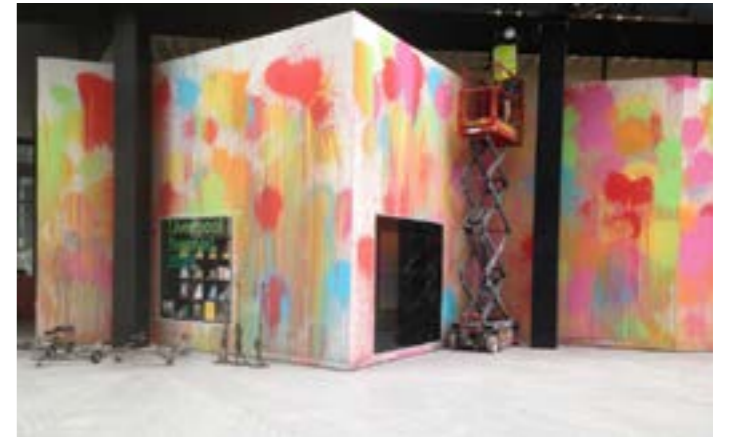
SPECTRA - OPEN EYE GALLERY - LIVERPOOL BIENNIAL -

The public participation piece uses the elements key to Walter & Zoniel's installations, of fun and surrealism and working on reassigning meaning to buildings and spaces that are familiar to us in a different context.