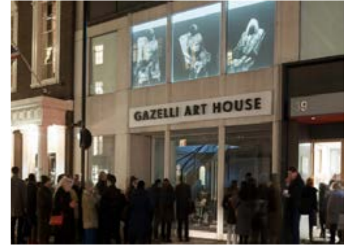
ANON - LUMIERE FESTIVAL - LONDON