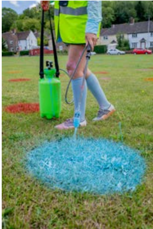
Eco-Paint being used in an Artwork in Brighton.

The art duo and their team will install the MODERN MYTHOLOGIES artwork throughout the county of Essex.