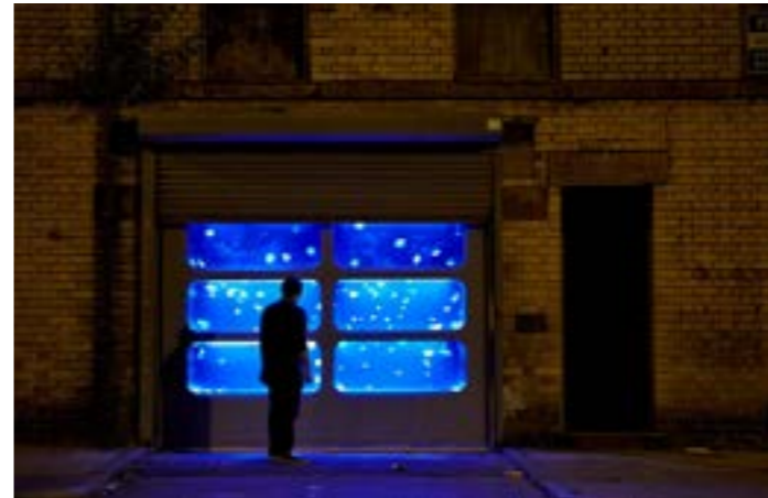
THE PHYSICAL POSSIBILITY - LIVERPOOL BIENNIAL -

Revealed in absolute secrecy, with no press or pr being released about the work. The first public experience of the installation was as dusk fell, when the shutters automatically lifted to reveal the surrealism living within. Allowing the artwork to naturally effect the neighbourhood.