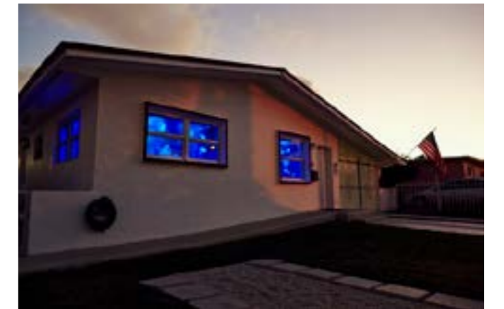
THE PHYSICAL POSSIBILITY - Miami Basel -

Revealed in absolute secrecy, with no press or pr being released about the work. The first public experience of the installation was as dusk fell, when the shutters automatically lifted to reveal the surrealism living within. Allowing the artwork to naturally effect the neighbourhood.