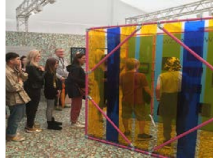
THE RAINBOW CAM - FRIEZE LONDON -

All of the work was a colourful celebration of the stories of the local and past residents of the area, the landscape and historical relevance.