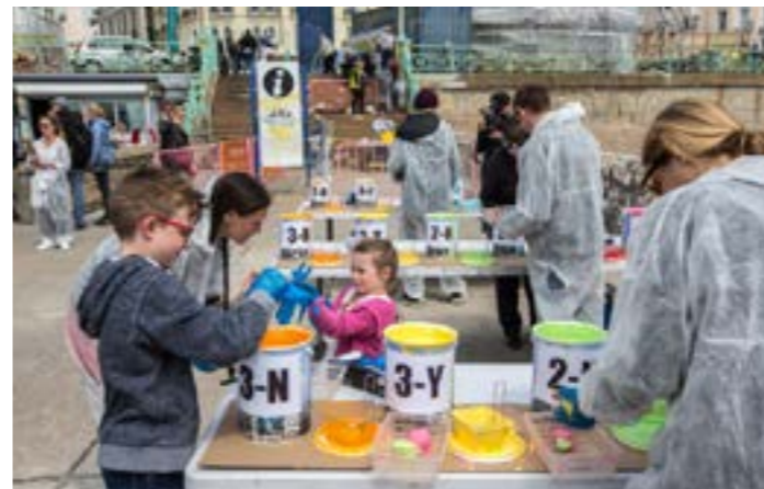
SPECTRA - BRIGHTON BEACH - BRIGHTON FESTIVAL -

Revealed in absolute secrecy, with no press or pr being released about the work. The first public experience of the installation was as dusk fell, when the shutters automatically lifted to reveal the surrealism living within. Allowing the artwork to naturally effect the neighbourhood.