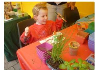
Busy Square this Summer.. With FREE arts and crafts and bike stunt displays