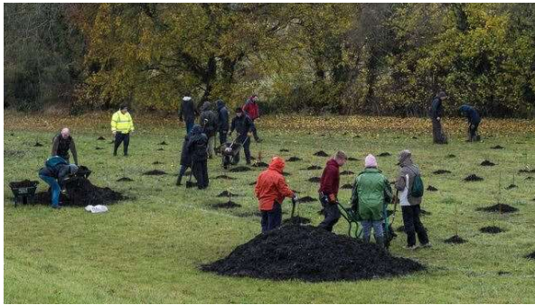
Lime Avenue Community Tree Planting saw SWTC Officers, Cllrs and residents working together to plant hundreds of new trees!