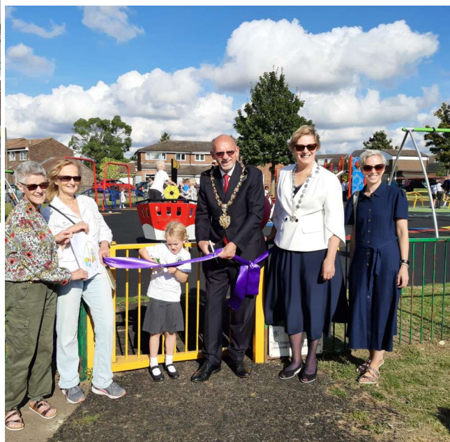
Golden Acre Playground refurbishments and grand opening