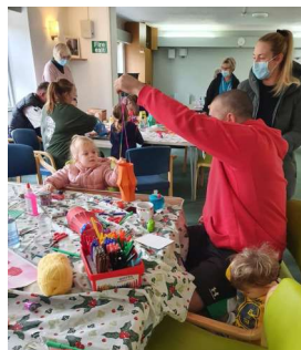
Two FREE Lantern making workshops were hosted by SWTC Officers with the help from volunteers ahead of the annual light switch on and lantern parade