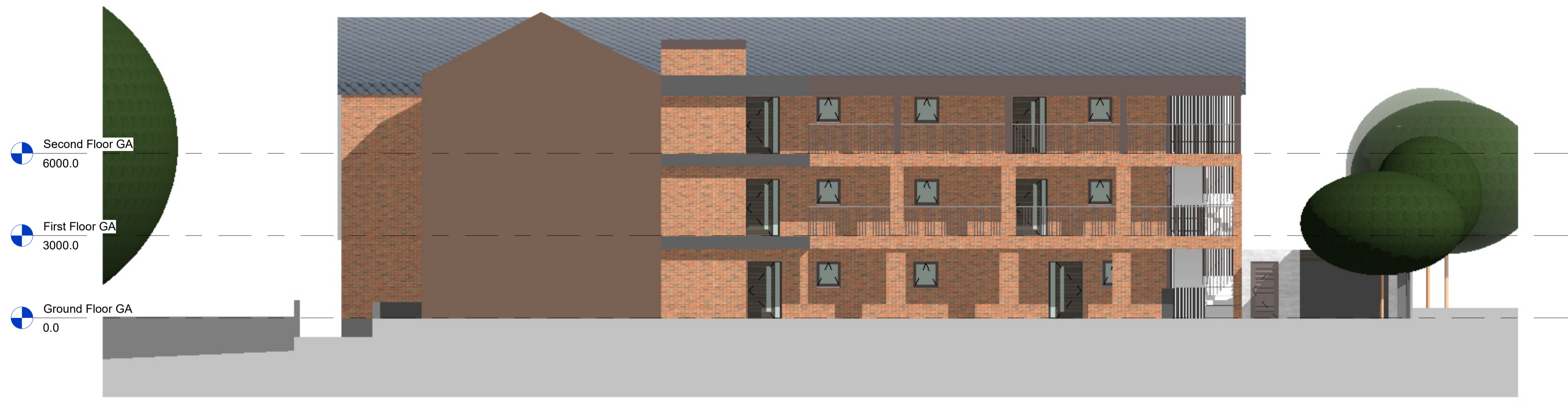
Inner East Wing 1 : 100