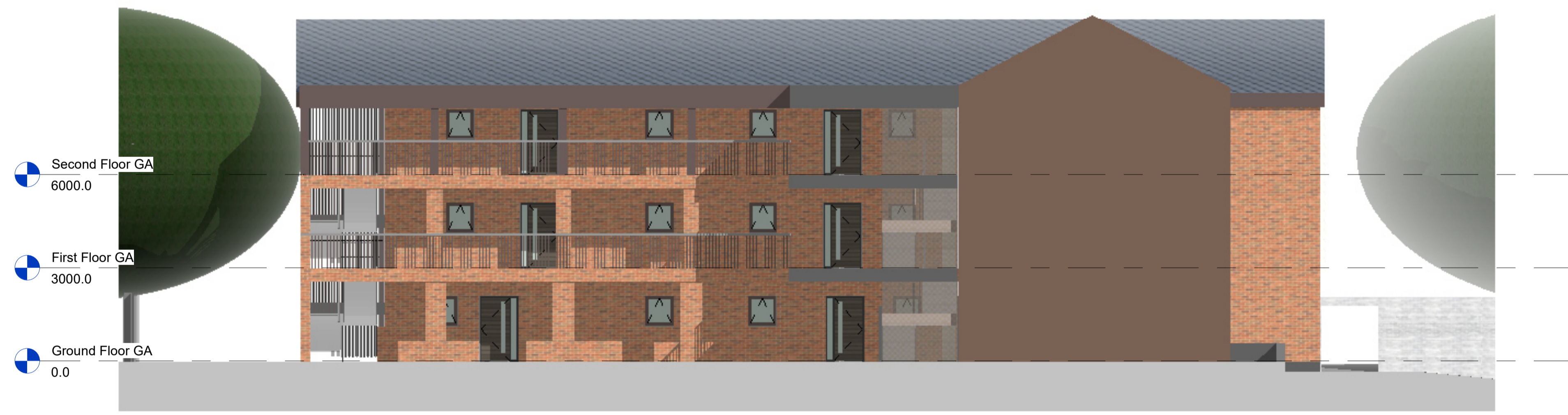
Inner West Wing 1 : 100