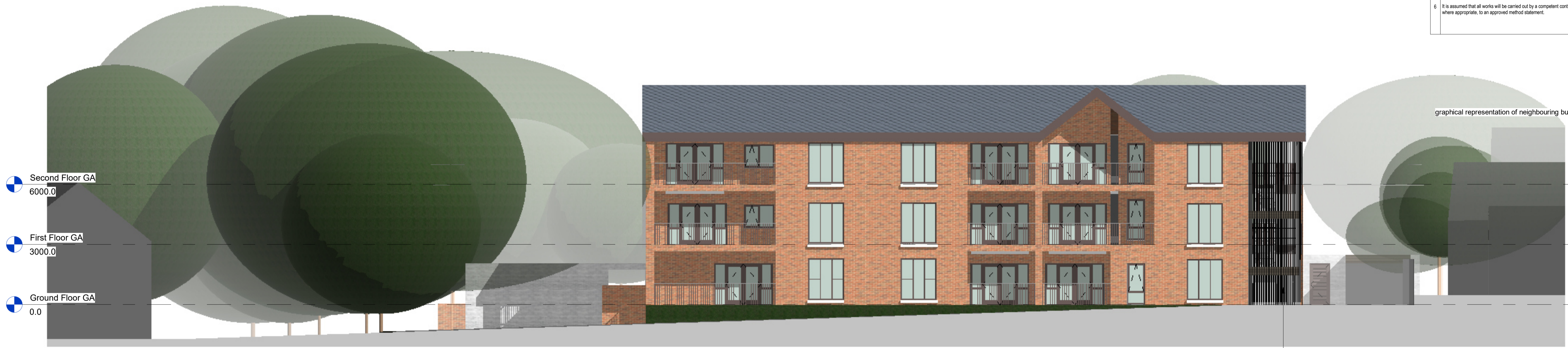
West 1 : 100

Timber slatted screens to plant/riser/ASHP and stair enclosure