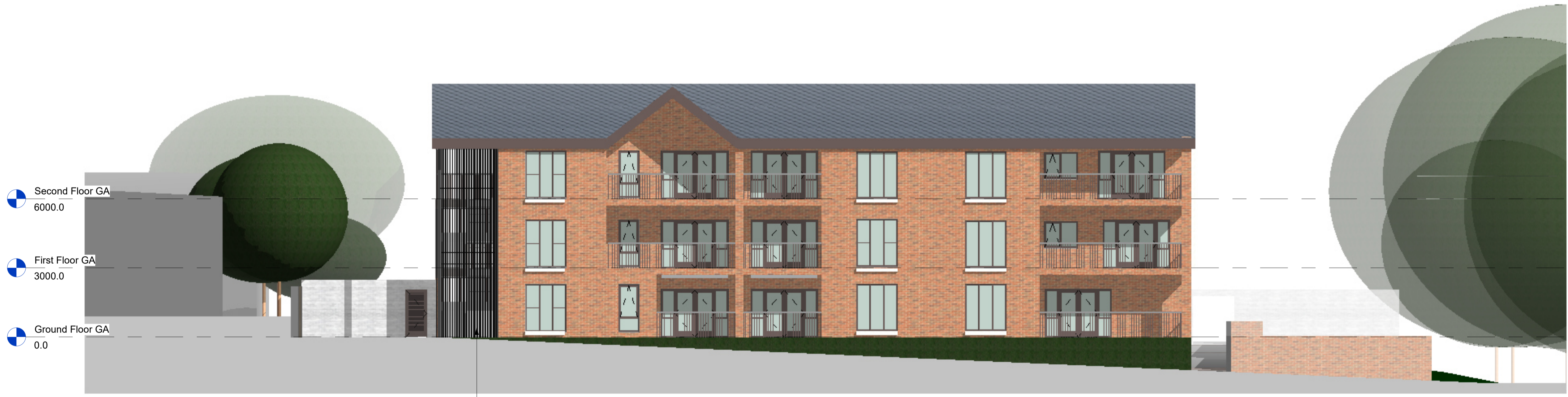
East 1 : 100

Timber slatted screens to plant/riser/ASHP and stair enclosure